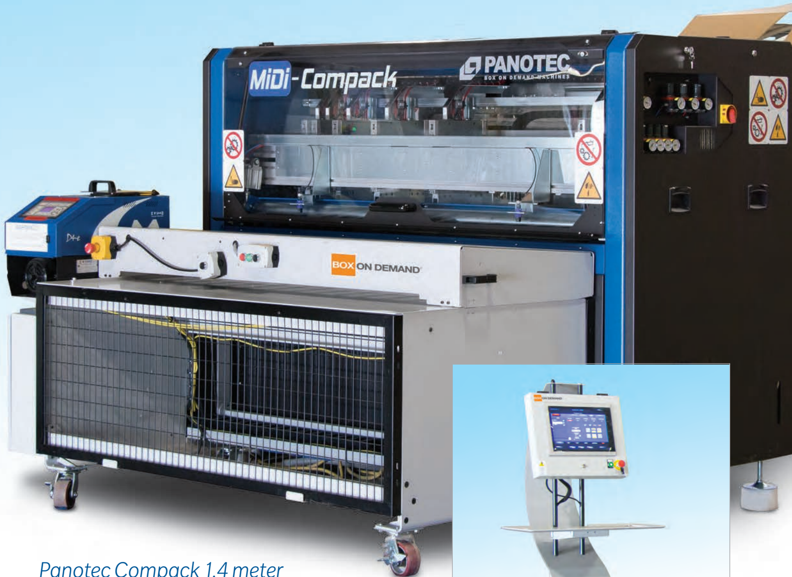
Panotec Compact 1.4 meter side-by-side